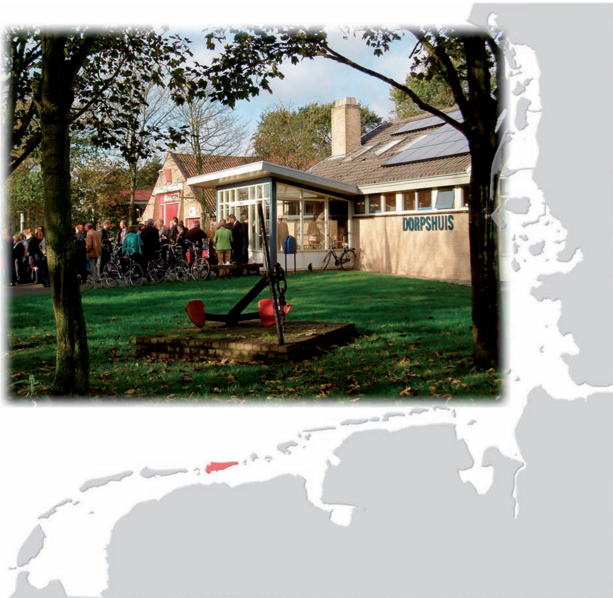
The Conference was held at the "Dorpshuis" on the island of Schiermonnikoog