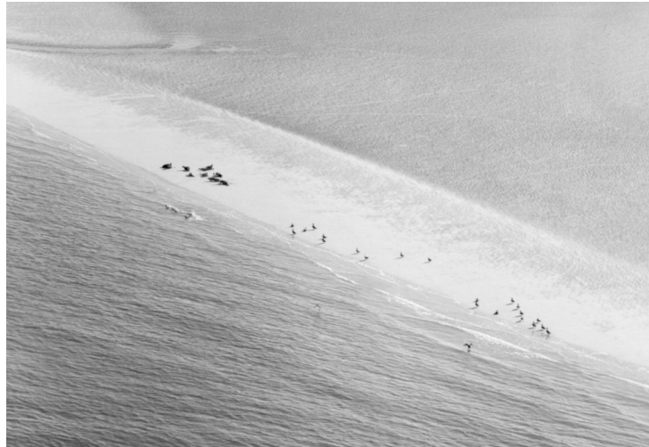
Harbour seals on a sandbank.