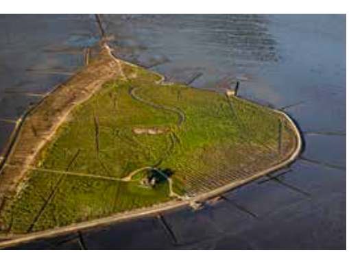
Hallig Marsh