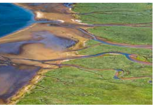
Natural barrier-connected marsh