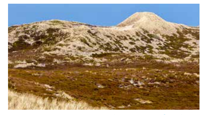
White and brown dunes

In total, there are about 20,000 ha of dunes and dune slacks in the Wadden Sea. Most are located on the seaside of the barrier islands, on small islands and a few locations along the mainland coast. Data on long-term development on the entire dune area is not available.